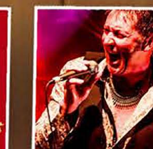
MACHINE HEAD DEEP PURPLE EXPERIENCE