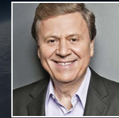
FEATURING SPECIAL GUEST RAY MARTIN