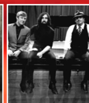
STOMPING IVORIES - THE DUELLING PIANO SHOW