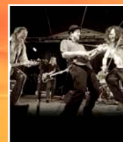
ROUND MOUNTAIN GIRLS