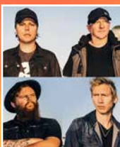
THE VIPER CREEK BAND