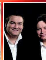
THE TOOMBS BROTHERS