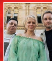
THE FERAL SWING KATZ