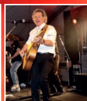
RUSTY AND THE AYERS ROCKETTES